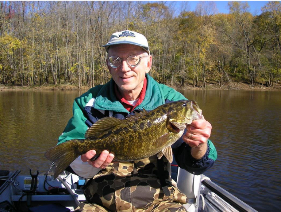
20 inch smallmouth bass from the Grand River