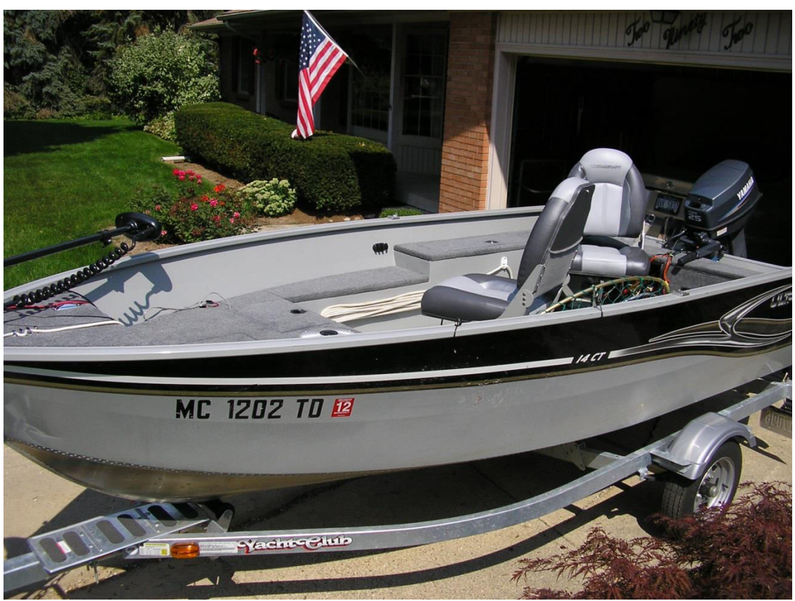
14 foot Ultracraft Boat Model 14 CT, 2009

Fishermen seem to be constantly striving to obtain that " perfect " or " ideal " fishing boat . Unfortunately, because waters, weather, individual goals, people, fishing methods, and other factors are always changing , the " perfect " boat for all situations does not exist . Over the years I have owned and used 9 different boats from a small canoe to a 15 foot Troller, most of them for Spoonplugging . When one looks at a boat as a tool used to control the depth and speed of lure presentation, the choices narrow considerably. Safety is of primary importance , and that depends on what type of waters you fish . Large wide open lakes that can get rough require a somewhat larger, wider, and deeper craft.